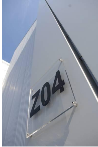
Chrome-free pre-treated aluminium sheet used on façades at Henkel's Headquarters in Düsseldorf, Germany.