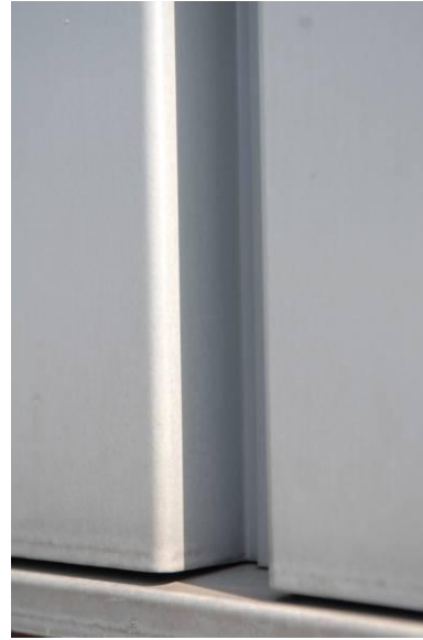
Chrome-free coil coated V-groove sheet performing well after 10 years service, even at its most sensitive point – the dripping edge.