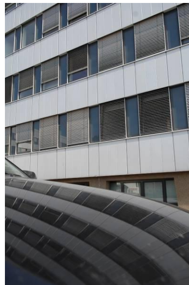
Batch-coated wall cassettes and sun stores made from coil coated stock – chrome-free pre-treatment technology provides reliable protection for coated aluminium.